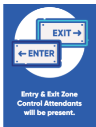
Entry & Exit Zone Control Attendants will be present.