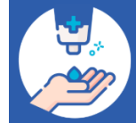
Everyone receives hand sanitizer before entering the facility.

• Our Zone Control Attendant will give you hand sanitizer for your hands. (You must accept hand sanitizer on your hands, or you will not be allowed into the building.)