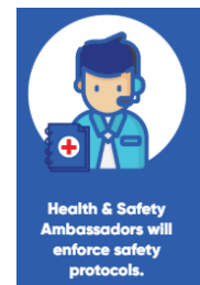
Health & Safety Ambassadors will enforce safety protocols.