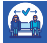
Participants must sit in designated spots in their dressing room and benches.